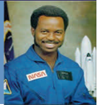
Dr. Ronald McNair