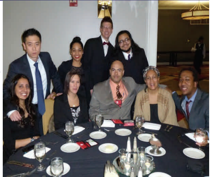
McNair Scholars at the MD conference with Director and Associate Director