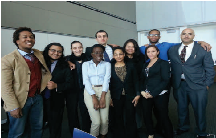
Second Year Scholars during Research Week at the Annual McNair Roundtable

On Friday, May 3, the McNair Program held its annual McNair Roundtable as part of John Jay College's Research Week, which highlights undergraduate research. This event provided an opportunity for our graduating Scholars/Associates to present the culmination of two years research. As always, the research topics were engaging and timely and the questions from the audience were lively. For some of our Scholars, this event was upwards of their sixth conference presentation, and this experience was evident in both their presentation and in the ease at which they addressed question.